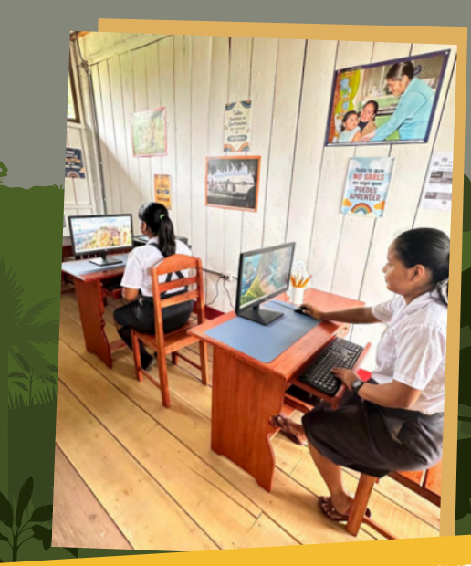
THANKS TO "KICK IT FORWARD" (MOTHER AND DAUGHTER TRAVELERS WITH AMAZONIA) FOR DONATING TWO COMPUTERS. A PRINTER. NEW BOOKS. AND MORE TO THE HIGH SCHOOL SPARKING EXCITEMENT AMONG STUDENTS.

In addition to the distribution of school supplies, last month AoA teamed up with the non-profit organization Kick It Forward, founded by a mother and daughter who are former travelers with Amazonia. They were inspired during their stay to get involved in the work of AoA. This year they purchased 2 new computers, a printer, some books and more. For the first time some of our students had an opportunity to use a real desk-top computer set.